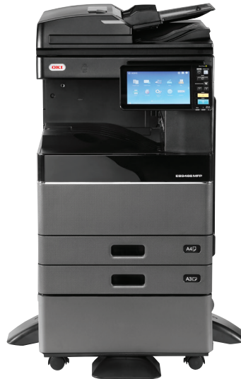
ES9466 MFP with RADF and Cabinet