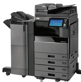
ES9466 MFP with DSDF, PFP, Drawer Module, Multi-Stapling Finisher and Hole punch Unit installed