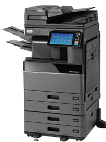
ES9466 MFP with DSDF, PFP, Drawer Module and Inner Finisher installed