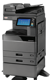
ES9466 MFP with DSDF and Cabinet